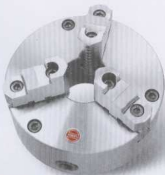
前锁 Front Mounting