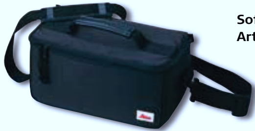
Softbag Art. No. 667169