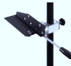
Adaptor for attachment to a pole and a tripod Art. No. 769459