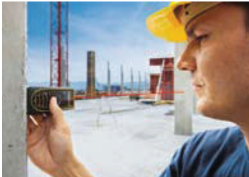
Measuring long distances thanks to Power Range Technology™ from Leica Geosystems.

More than 15 years ago Leica Geosystems brought out the first hand-held laser distance meter and revolutionised the world market. Since then we have set the standards for productivity in modern measuring. A lively spirit of innovation inspires our highly motivated development engineers to keep coming up with new ideas. They lead to products that win over the customer with their robustness, reliability and precision. Leica DISTO™ eases our customers' everyday tasks.