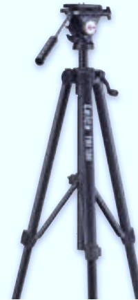
Tripod Leica TRI 100 Art. No. 757938 Quality tripod with very easy fine adjustment.