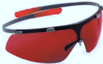
GLB30 Super light laser visibility glasses 3 in one Art. No. 780117 with 3 different lenses: laser visibility glasses, safety glasses, sun glasses