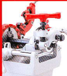
RG-R1 with NP50A