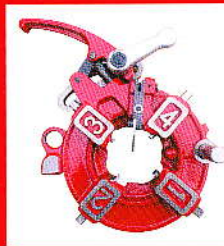
NV-type Die head